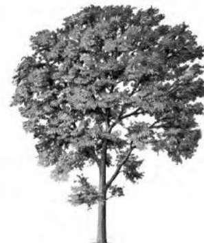
Ash represents the letter N