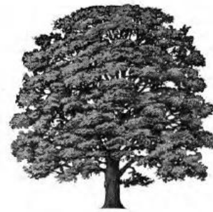
Oak represents the letter D